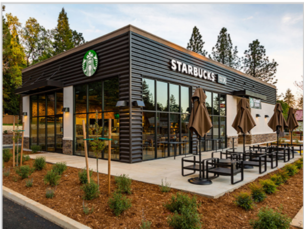
Hanley Investment Group Brokers Sale of Two Starbucks Properties in Northern California for $5.5M

Get more news delivered to your inbox. Subscribe to France Media's twice-weekly regional e-newsletters. Click here.