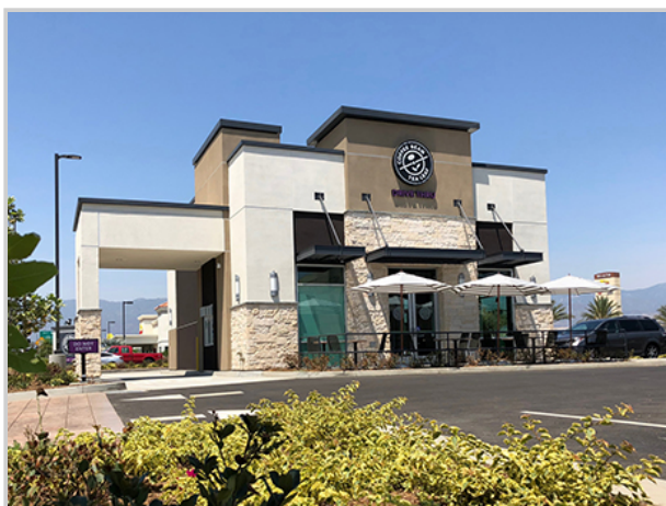
Hanley Investment Group Negotiates $2.9M Sale of Single-Tenant Retail Property in Rialto, California