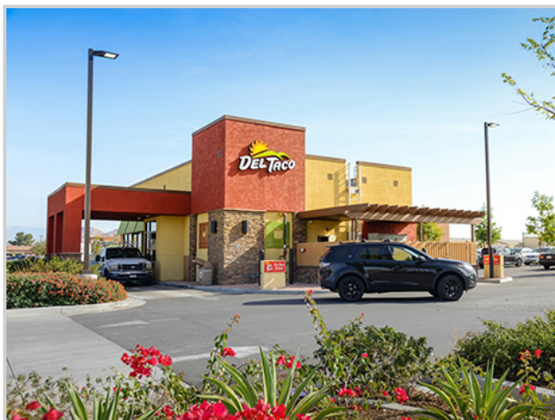
Hanley Investment Group Negotiates $2.8M Sale of Single-Tenant Restaurant Property in Perris, California