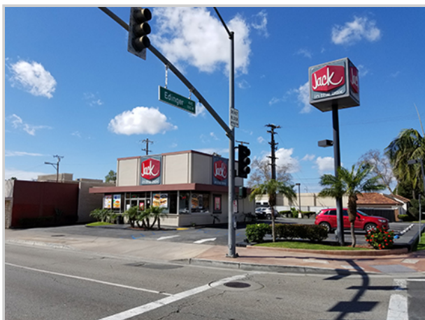
Marcus & Millichap Brokers $1.5M Sale of Restaurant Property in Santa Ana, California