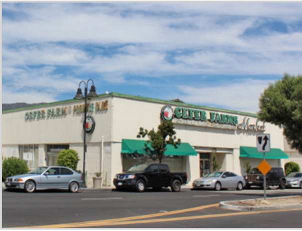
SBH Real Estate Group Acquires Vacant Retail Property in Burbank for $5.2M